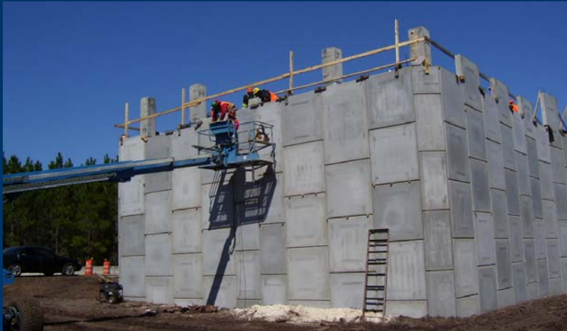
Crews complete the top panels on one of the retaining walls for the overpass.